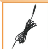
EXTERNAL TEMP. P MI-T22 COLOR: BLACK SIZE: 2CM PROBE W/O HANDLE CABLE: 200CM W/3.5MM JACK