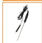
EXTERNAL TEMP. PR MI-T215 COLOR: BLACK SIZE: 15CM PROBE W/HANDLE CABLE: 116CM W/3.5MM JACK